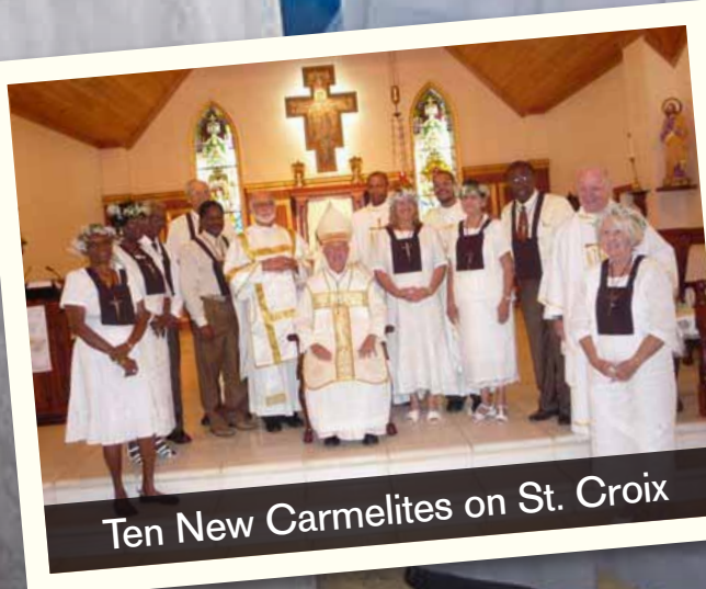
Ten New Carmelites on St. Croix