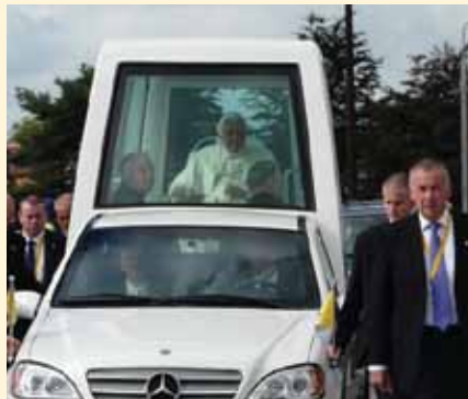
The Holy Father visited Great Britain on September 16–19.