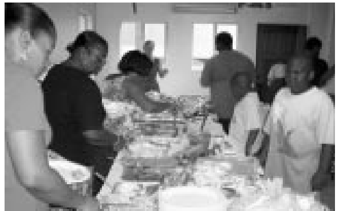
Parishioners prepared and served Thanksgiving lunch to over 100 guests at Our Lady of Mt. Carmel Church on St. John on November 24.