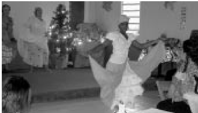
The Cursillo Movement held its annual Christmas party in the Hospitality Lounge of St. Joseph Church on St. Croix on December 11. The program included a demonstration of Hispanic folk dancing.