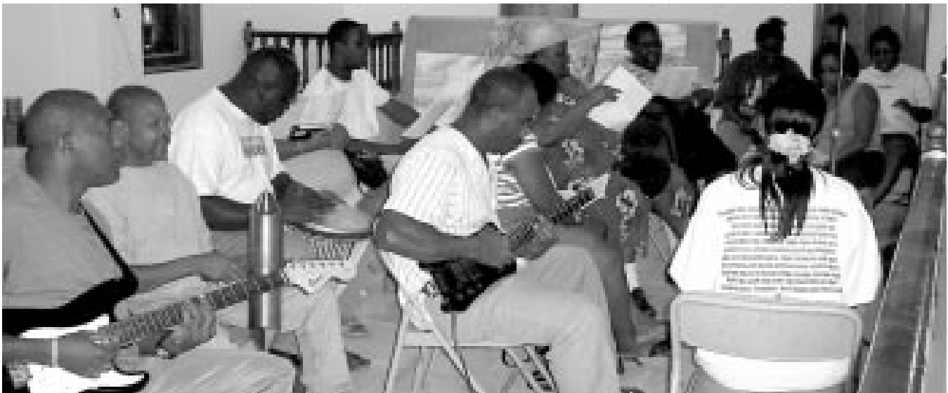
The choir rehearsed for the dedication of Our Lady of Mt. Carmel Church on St. John in the new church's balcony.