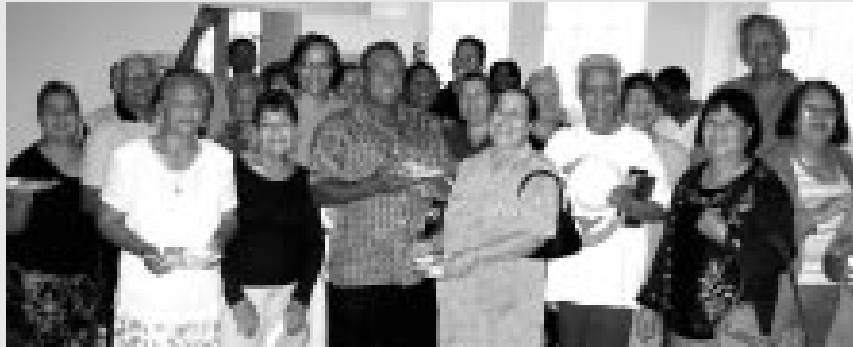
Desayuno seguía las Misas de aguinaldo en la Iglesia Holy Cross en Sta. Cruz.