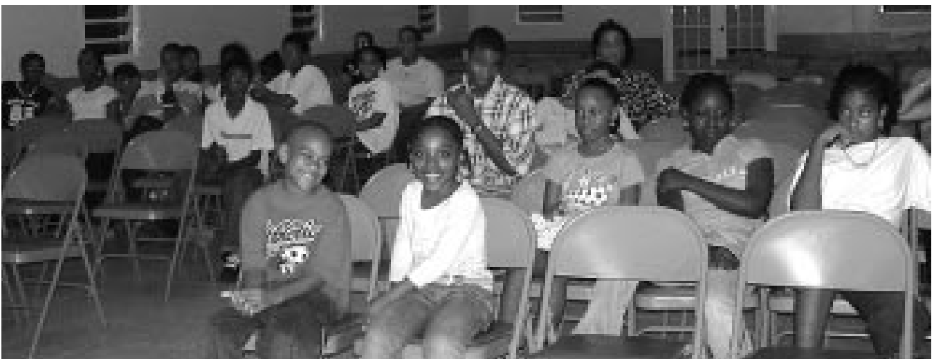
Members of the St. Joseph Church Children's Choir had an Advent Day of Reflection in the parish's Hospitality Lounge on St. Croix on December 21 as part of the choir's ten-year anniversary celebration.