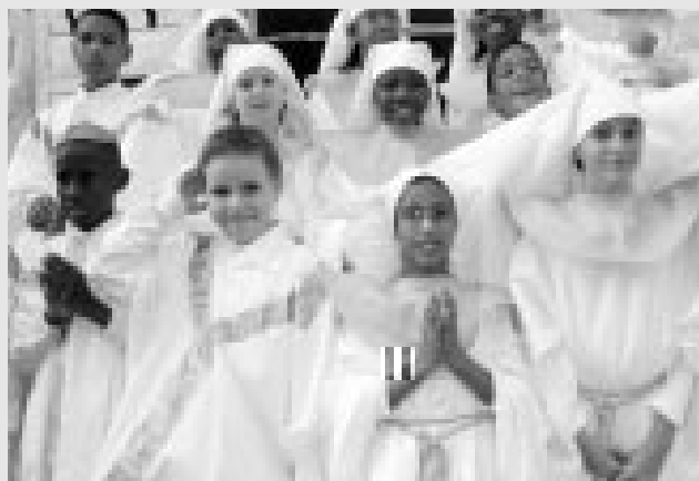
Two Catholic schools staged Christmas pageants on December 11.