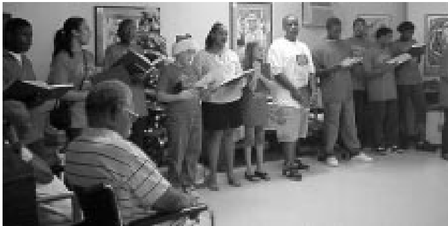
The altar servers of Sts. Peter and Paul Cathedral visited Sea View Nursing Home on St. Thomas on December 17, singing carols and reading a Christmas story.