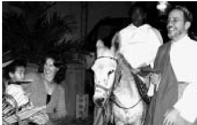
"Joseph" and a pregnant "Mary" on top of a donkey brought the Christmas story alive outside of Our Lady of Mt. Carmel Church on St. John on Christmas Eve.