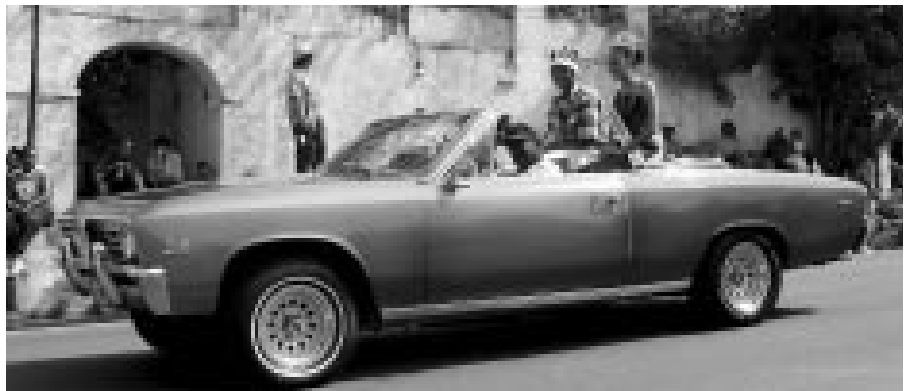
Mr. and Miss St. Joseph rode in the Cruzan Christmas Adult Parade on January 7.