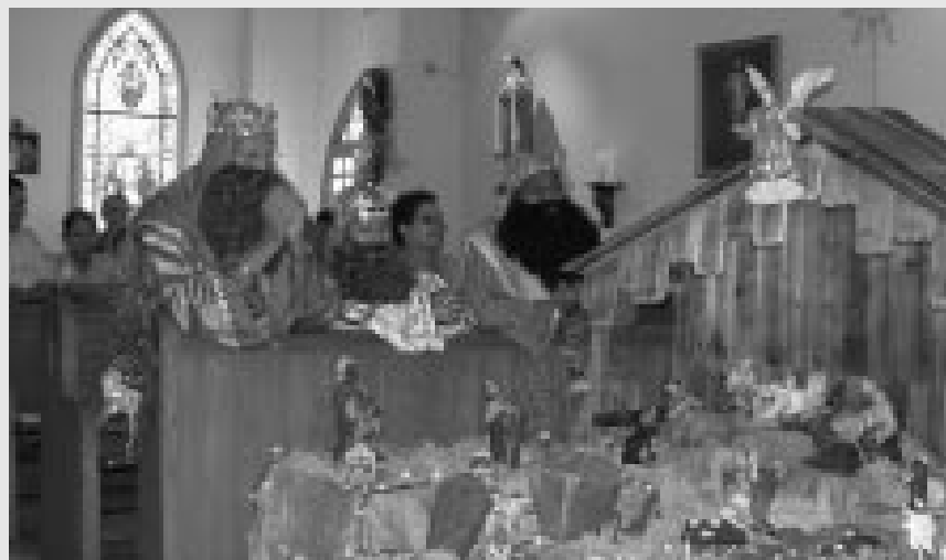
Los Tres Reyes Magos oraron cerca del nacimiento en la Iglesia San José en Santa Cruz el domingo de la Epifanía, 8 de enero. Después de la Misa en español, los reyes dieron dulces a los niños en el salón social de la parroquia.