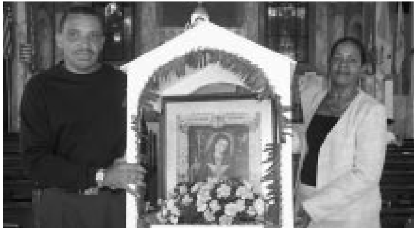
An image of Our Lady of Altagracia, Patroness of the Dominican Republic, was venerated at Ss. Peter and Paul Cathedral on St. Thomas on January 22.