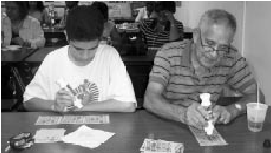
Ss. Peter and Paul School on St. Thomas raises funds monthly with bingo in the school cafeteria. The next bingo is Friday, February 10, at 7:00 p.m.