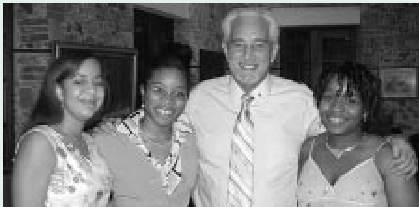
Three Catholic youth were honored by the Hebrew Congregation of St. Thomas.