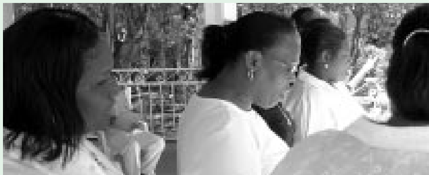
The choir of Our Lady of Mt. Carmel Church on St. John sang in the park.