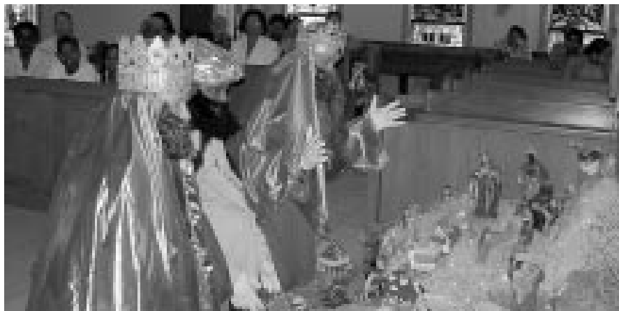
Los tres reyes magos encontraron el niño Jesús en la Iglesia San José en Sta. Cruz durante la Misa en español de la Epifanía, el 7 de enero.

Como penitencia, la Iglesia San José en Sta. Cruz proponen a sus feligreses que en los viernes de cuaresma, en vez de comer una cena regular, que vengan a la parroquia para compartir la alternativa de una cena simple de pan y sopa vegetariana hecha en casa a las 6.45 p.m.