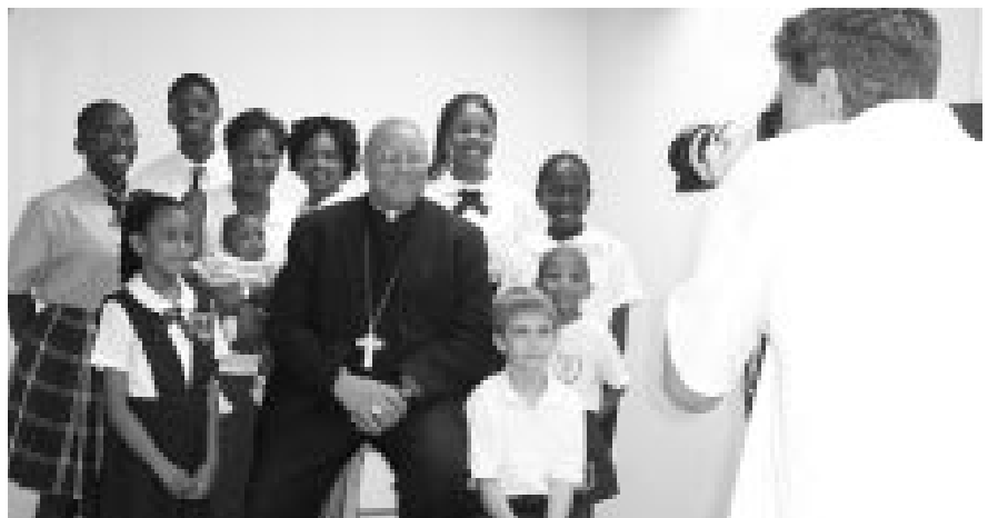
In preparation for the launch of the Bishop's Appeal 2007 on February 24, Bishop George Murry, SJ, posed for promotional photographs with students from the four Catholic Schools of the Virgin Islands.