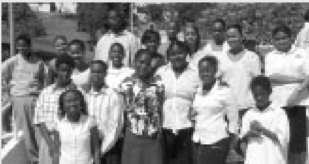
Confirmation candidates at Holy Family Church on St. Thomas attended Sunday Mass together on January 21. They participated in the Rite of Inscription in anticipation of their reception of the sacrament on Sunday, June 3.