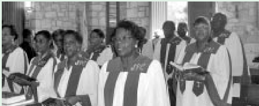
The adult choir of St. Patrick Church on St. Croix sang at Sunday Mass.