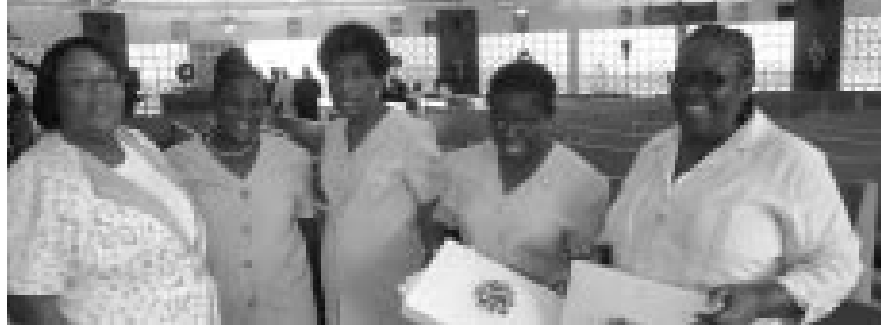
Members of the St. Vincent de Paul Society at Holy Family Church on St. Thomas brought Christmas gifts to the sick of the community after Mass on December 31.