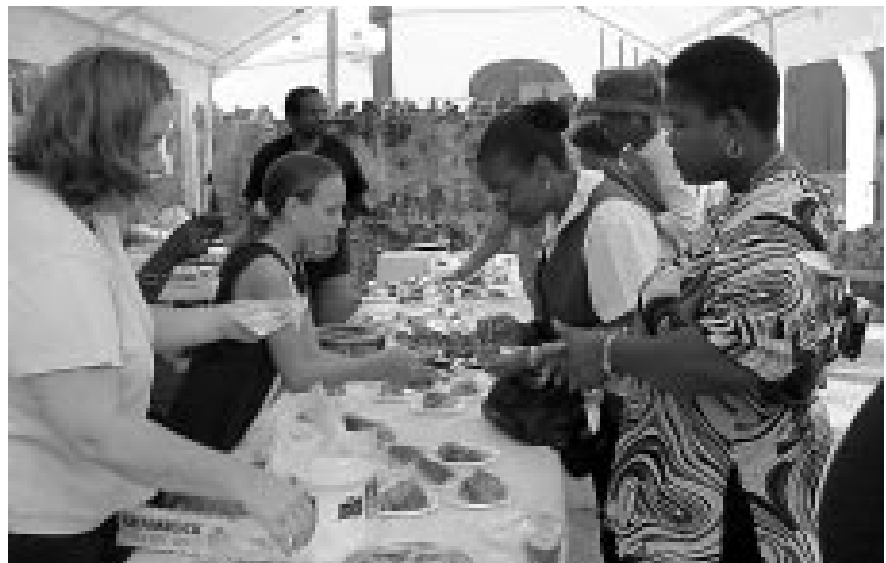
Parish volunteers held a Bake Sale after all the Sunday Masses to raise funds for Ss. Peter and Paul Cathedral on St. Thomas on February 12.