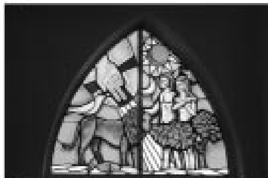
Sanctuary Window, Cathedral of St. Francis Xavier, Nassau, Bahamas

Established in 1984, Botti Studio serves the ecclesiastic environment through design, fabrication, delivery and installation. Experts in restoration and conservation. Botti professionals are available for consultation.