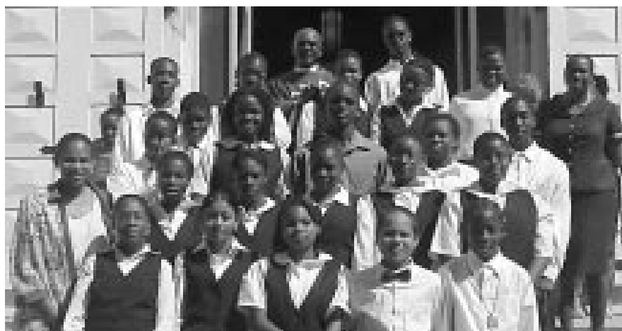
Thirty members of the Addelita Cancryn Jr. High School National Honor Society attended Sunday Mass together at Ss. Peter and Paul Cathedral on St. Thomas on March 12.