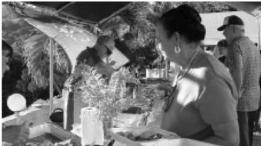
Our Lady of Perpetual Help Church on St. Thomas had its annual International Dinner on February 26.