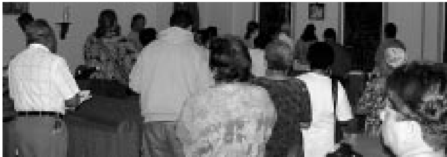
Stations of the Cross are prayed in English and Spanish on Fridays of Lent at St. Joseph Church on St. Croix.