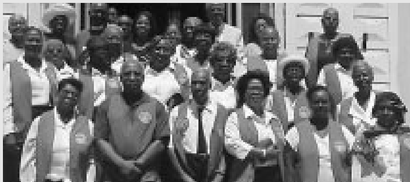
Forty members of We From Upstreet, Inc., celebrated the not-for-profit organization's eleventh anniversary with Sunday Mass at Ss. Peter and Paul Cathedral on St. Thomas on March 12.