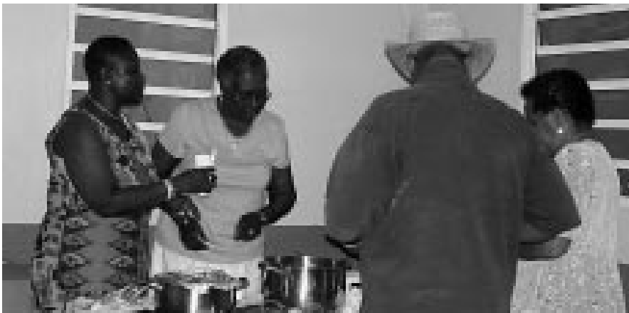
A simple homemade soup and bread are served on Fridays of Lent before the Stations of the Cross at St. Joseph Church on St. Croix.