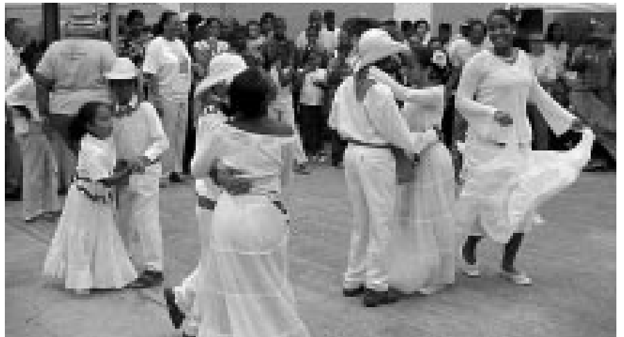
Folk dancing was displayed in the schoolyard.