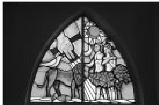
Sanctuary Window, Cathedral of St. Francis Xavier, Nassau, Bahamas

Established in 1964, Botti Studio serves the ecclesiastical environment through design, fabrication, delivery and installation. Experts in restoration and conservation. Botti professionals are available for consultation.