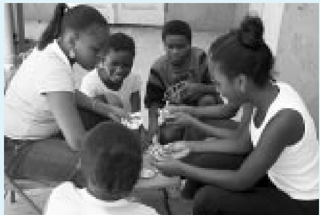
Pictured above, children played dominoes, basketball and card games in the Kids Learn Summer Enrichment Program on St. Thomas.