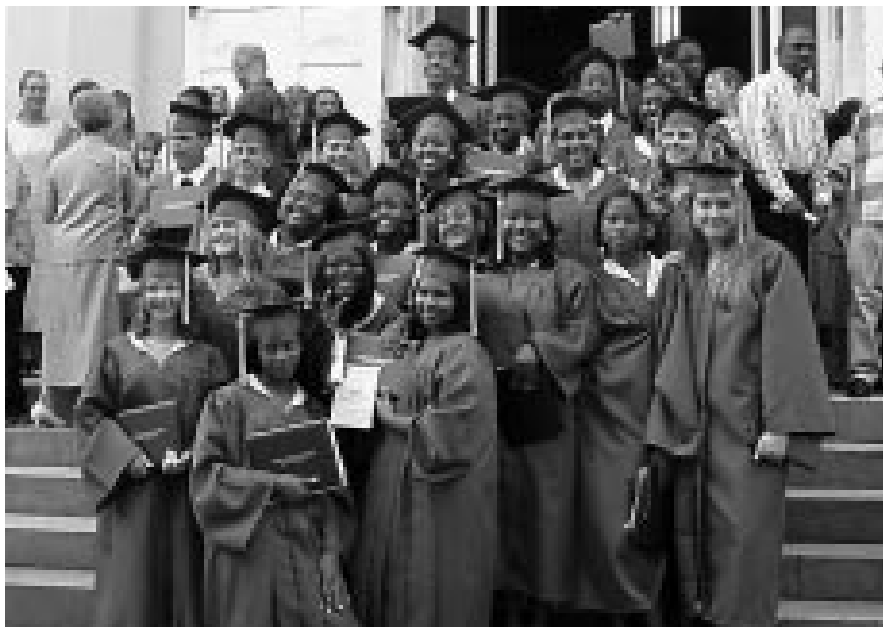
The Ss. Peter and Paul School Eighth Grade Class of 2005 had its commencement exercises at Ss. Peter and Paul Cathedral on St. Thomas on June 9.