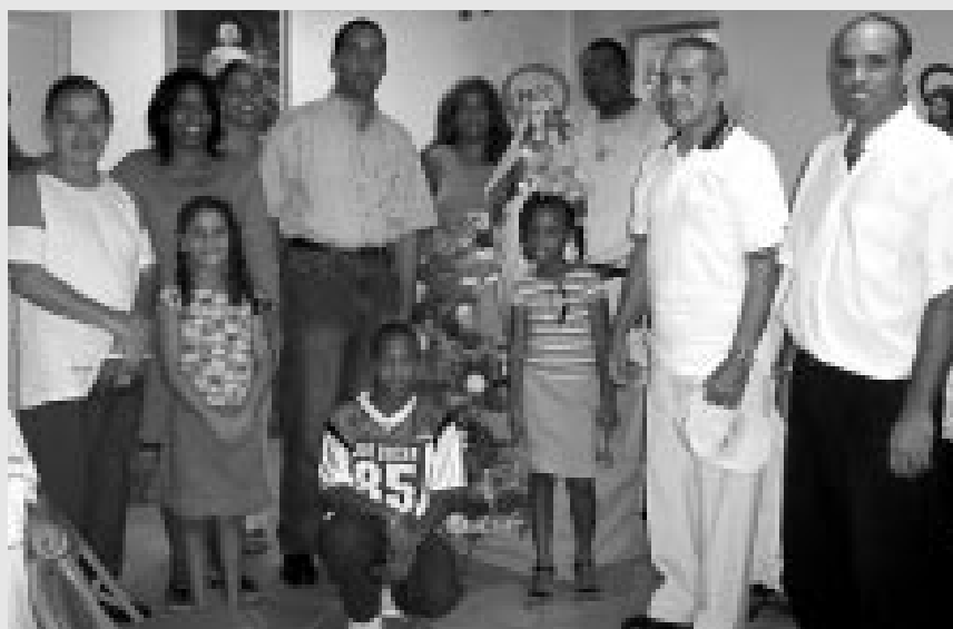
La comunidad hispana de la Iglesia Nuestra Señora del Carmen en St. John se acercaron a su imagen después de la Misa Patronal el 17 de julio.