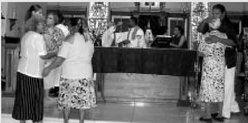
La comunidad hispana de la Iglesia San José en Sta. Cruz celebró la fiesta de San Juan Bautista con Misa el 24 de junio.