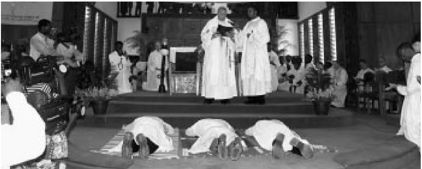
Below: The three new priests prostrated as the congregation sang the Litany of the Saints.