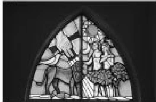
Sanctuary Window, Cathedral of St. Francis Xavier, Nassau, Bahamas

Established in 1964, Botti Studio serves the ecclesiastical environment through design, fabrication, delivery and installation. Experts in restoration and conservation, Botti professionals are available for consultation.