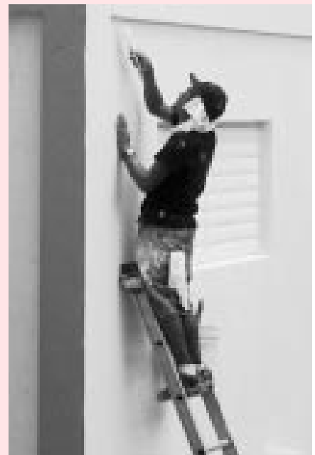
By the time school opened, the customary blue at Ss. Peter and Paul School was replaced by yellow.