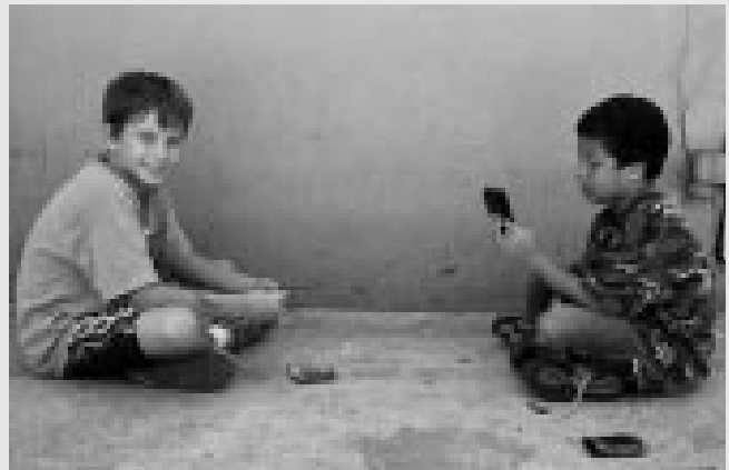
Over fifty children on St. Thomas enjoyed a summer camp sponsored by Catholic Charities of the Virgin Islands.