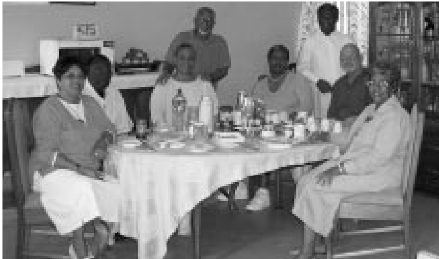
Middle photograph: The pilgrims visited Peter Cardinal Turkson in his residence; Cardinal Turkson is standing, wearing white.