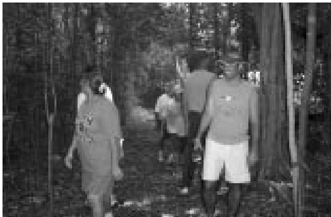
Parishioners of Our Lady of Mt. Carmel Church on St. John enjoyed a community fun day that included a hike, a picnic and a swim at Cinnamon Bay on July 31.