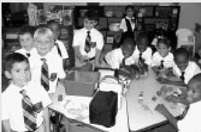
The kindergarten class at St. Mary School on St. Croix is among the beneficiaries of the Bishop's Appeal.