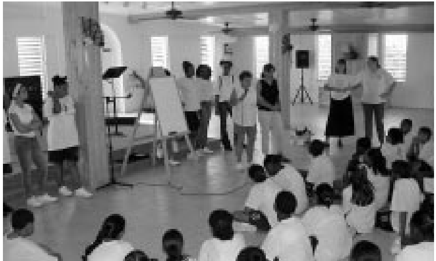
Seventh graders from St. Mary School on St. Croix gathered for a day long retreat at St. Ann Church on September 21.

Eighth graders at St. Patrick School on St. Croix had a spiritual retreat at Light of Christ Retreat Center on September 15. Workshops taught about self esteem and character building.