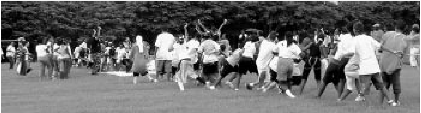
Seniors at St. Joseph High School on St. Croix welcomed new students with a Fun Day on the athletic field on September 7. The initiation included a "tug of war."