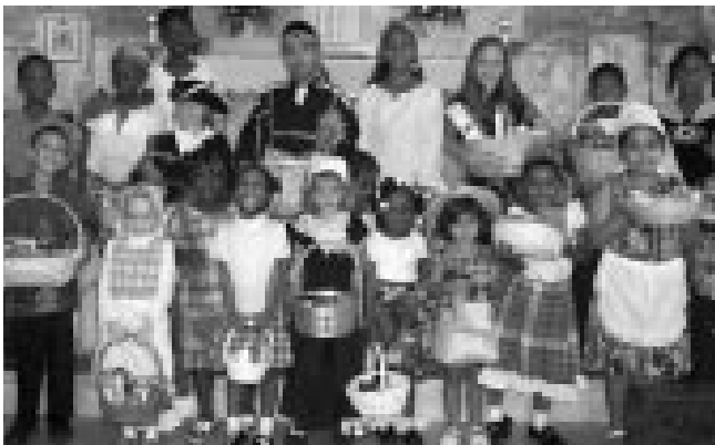
Ss. Peter and Paul School students in native dress presented food baskets for the poor at the offertory at the school's Thanksgiving Mass at Ss. Peter and Paul Cathedral on St. Thomas on November 2.