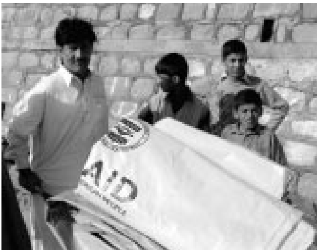
CRS distributed hundreds of tarpaulins to help victims of the earthquake construct temporary shelters.