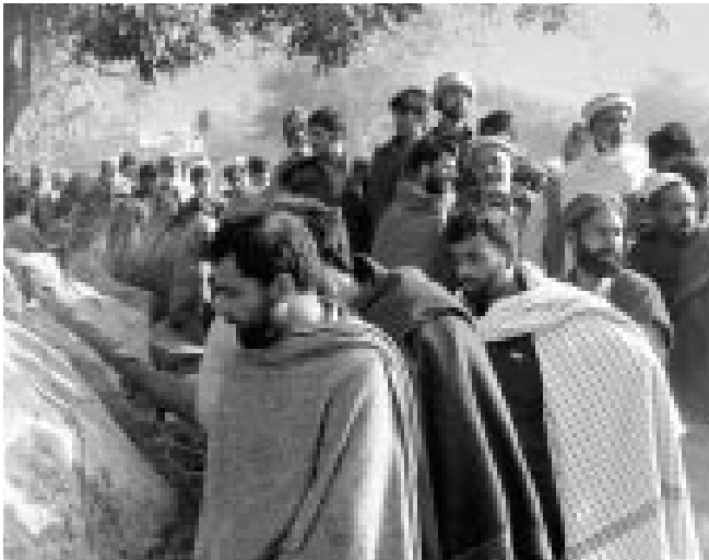
Residents of northern Pakistan lined up to receive relief supplies from CRS.