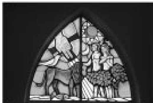
Sanctuary Window, Cathedral of St. Francis Xavier, Nassau, Bahamas

Established in 1984, Boffi Studio serves the ecclesiastic environment through design, fabrication, delivery and installation. Experts in restoration and conservation. Boffi professionals are available for consultation.