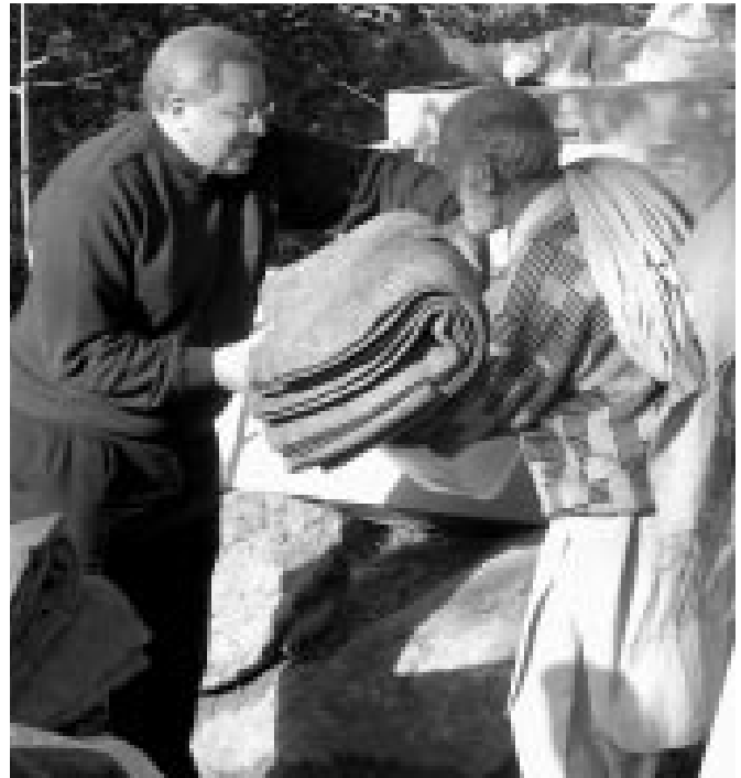
In Muzaffarabad, Bishop Murry helped in distributing blankets, water containers, and tents.

"Once again, we can be proud of our Church and the way it extends a hand of help to those who are in need," Bishop Murry told The Catholic Islander .