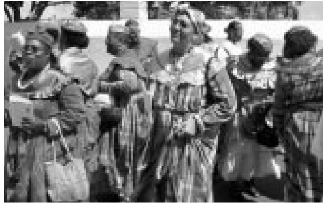
Native dress was abundant when Dominica Independence Day was celebrated with a Mass of Thanksgiving at St. Ann Church's Joachim Center on St. Croix on November 6.