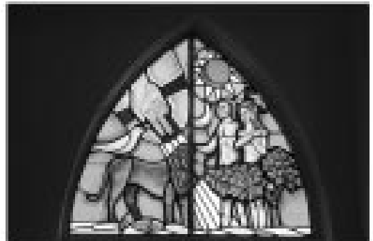
Sanctuary Window, Cathedral of St. Francis Xavier, Nassau, Bahamas

Established in 1864, Botti Studio serves the ecclesiastic environment through design, fabrication, delivery and installation. Experts in restoration and conservation, Botti professionals are available for consultation.